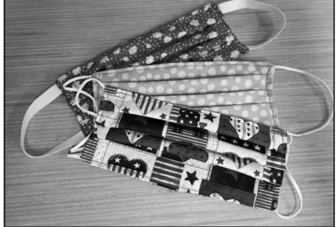
Sample of facemasks sewn by local Girl Scouts