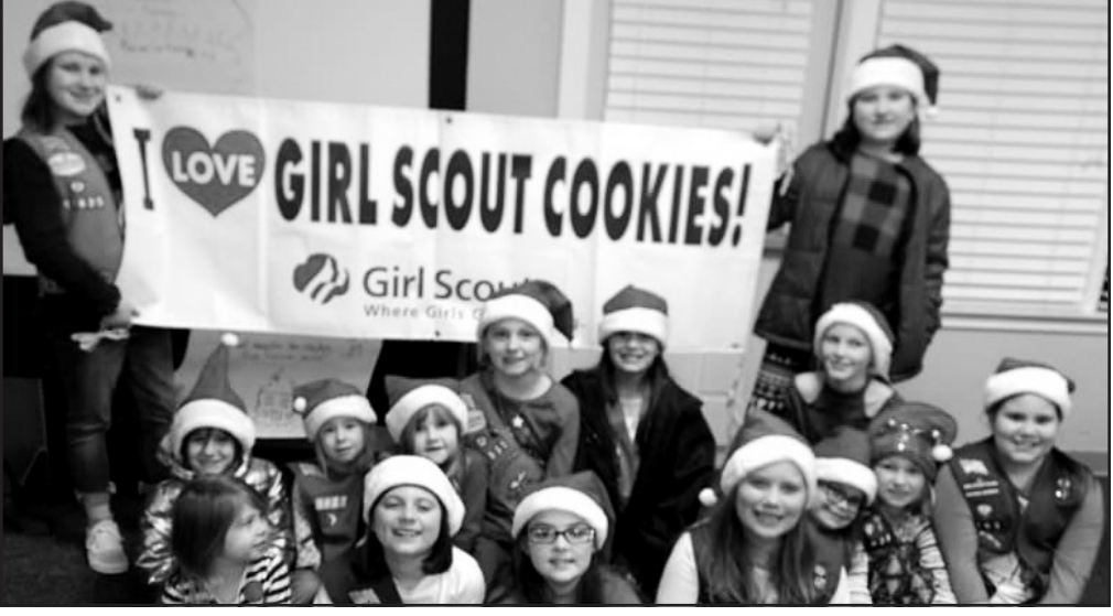
Union County Girl Scout Troop

The Girl Scouts of Towns/Union/Fannin counties met via Facebook Live Video on Tuesday, March 24th, and coordinated efforts to do their community service during this difficult time of coronavirus. Made aware that there was a serious shortage of facemasks for healthcare workers, the girls took a short lesson on cutting fabric and elastic to be sent for sewing.